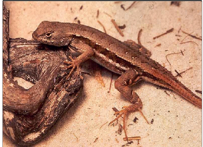
Figure 1. The Florida scrub lizard

The range of the Florida scrub lizard is restricted entirely to Florida. These lizards occur in disjunct populations in central Florida and on the Atlantic Coast (Figure 2). Populations also once occurred along the Gulf Coast of Florida in Lee and Collier counties, but most or all of these populations may have been extirpated due to increasing development along the coast. Scrub lizards are habitat specialists that live in dry upland such as sand pine scrub, oak